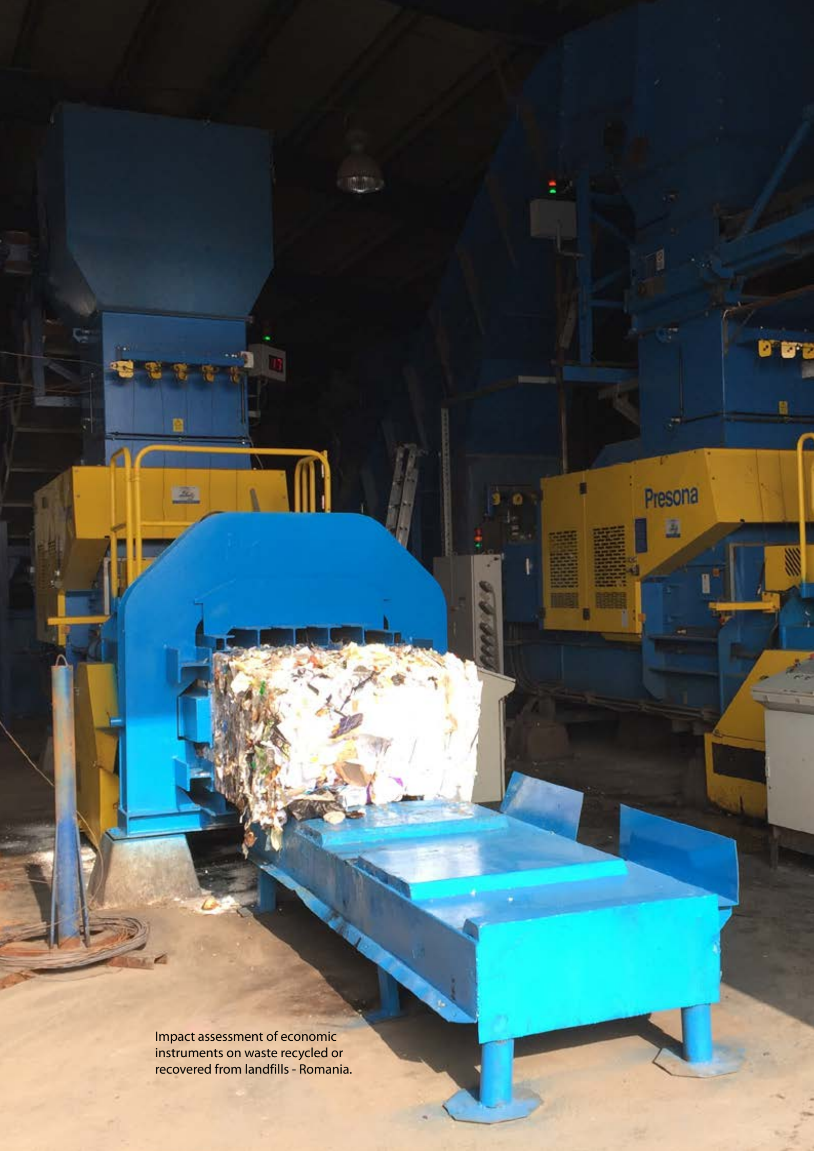
Impact assessment of economic instruments on waste recycled or recovered from landfills - Romania.