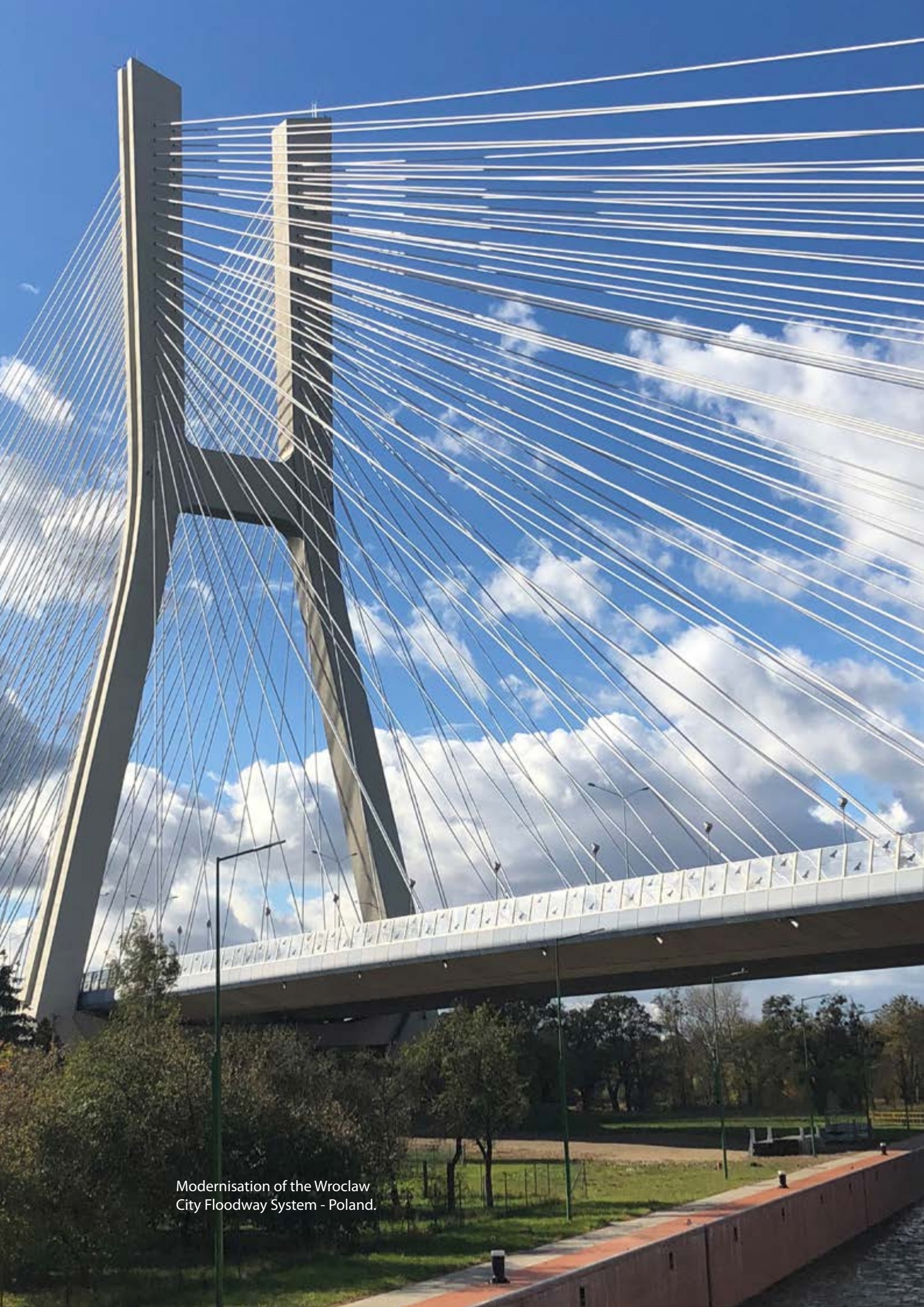
Modernisation of the Wrocław City Floodway System - Poland.