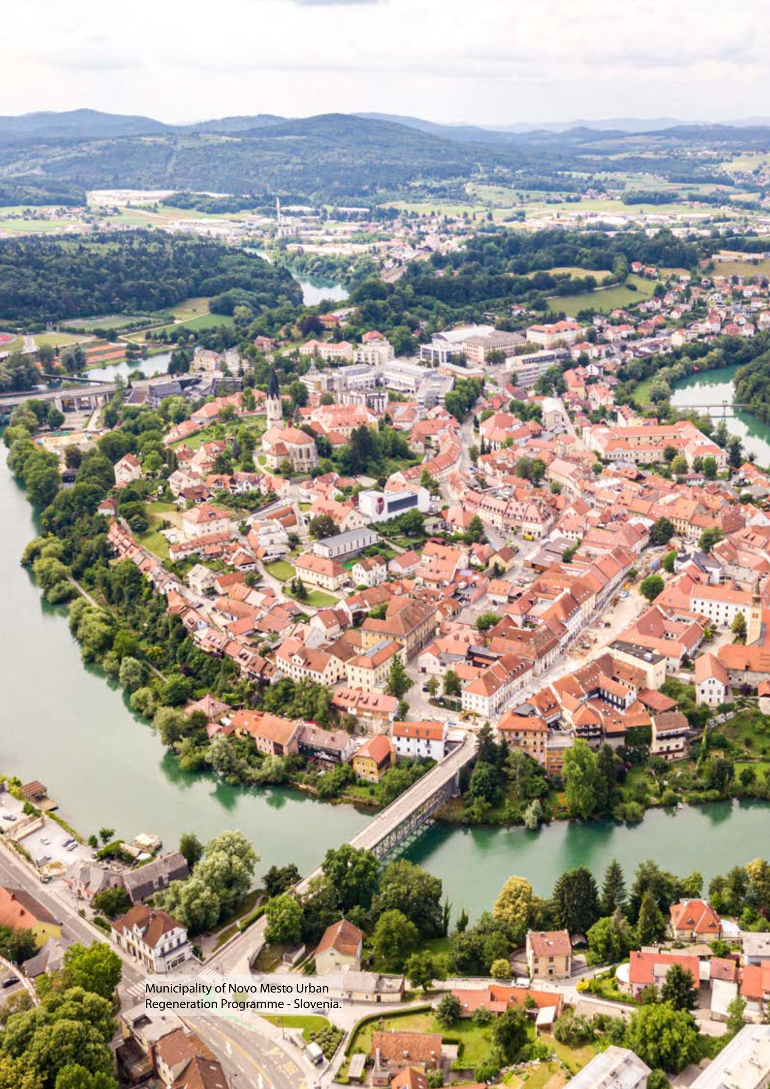
Municipality of Novo Mesto Urban Regeneration Programme - Slovenia.