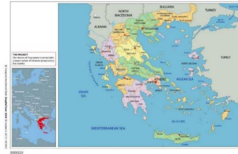
Project: EU FUNDS CO-FINANCING 2021-2027 (GR) - Greece